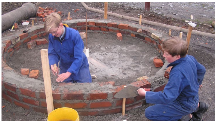
Primary boys building a brick flower bed at the school garden. Practical activities are treated as the best learning experiences.

Children spend the mornings in the classroom and the afternoons in practical Community activities with their parents and other adults to gain a balance between academic and practical learning. The 15-year-olds normally enjoy their final school year in work experience with some part-time studies before entering into the Community workforce. When needed, some study further for particular purposes. Apprenticeships and tertiary education follow when beneficial for our life.