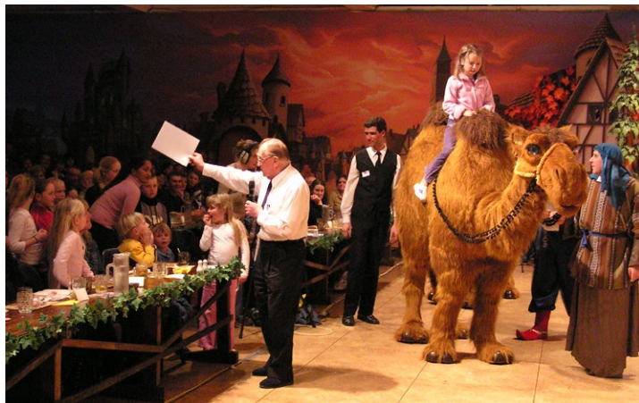
Hundreds of children rode our camels at the ends of the concerts.

Our guests receive four hours of quality entertainment and a three course meal. The concert features musical items, dance, songs, choirs, comedy skits and an orchestra. Nobody is ever disappointed.