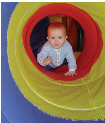
Every day is an adventure for our babies.

Four early childhood centres provide undivided love and care for children until school age while their mothers contribute to the Community work. Babies are given the best of care in their own special centres, where their mothers come to breast-feed them. At 15 months, the children move to our Toddlers' Centre at one of the accommodation blocks. Here they continue with organised activities in the morning and a sleep in the afternoon. At about three years, they start at Preschool.