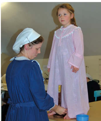
The sewing room makes most of our clothing and soft furnishings.