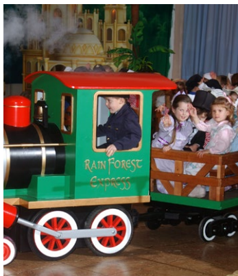
Preschoolers love acting in the concerts we do every two years.

These four registered centres all pass their inspections from the government Education Review Office. Visitors often comment on the happiness and order of our children, who learn early in life the attitudes they need to live in Community.