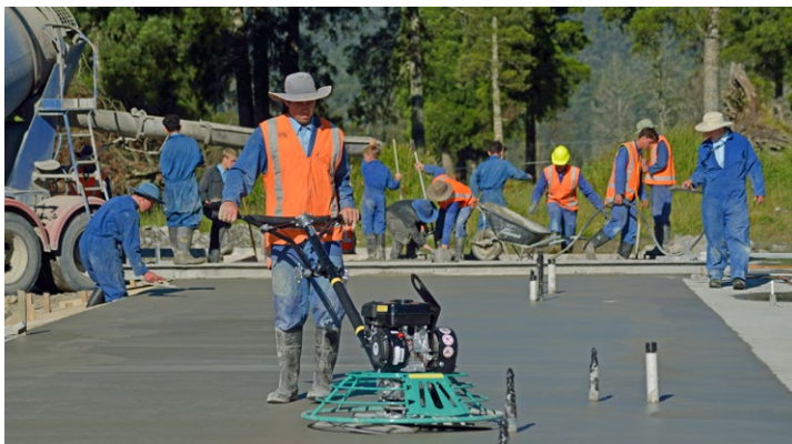
Builders pour the concrete pad for our new school building, which will be big enough for 250 students.

accommodation blocks, a service shed, three rotary dairies, many farm buildings, an aircraft hangar, engineering and joinery workshops, a hydro generating plant, covered swimming pool, killing shed and processing factories for the meat meal plant. Our engineers maintain tractors, trucks, vans and cars, as well as other machinery, while building new machines. Although some departments may not generate income directly, they keep everything going for those that do.