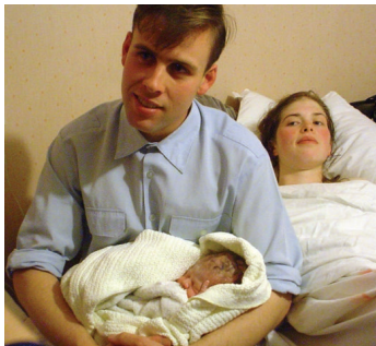
Parents with their third baby, born at home with no problems.

Contrast this with the fact that New Zealanders abort 14,000 babies a year, and destroy many, many times more with birth control. It's simply a matter of timing as to when would-be parents choose to destroy their own children. And no matter whether the unborn is labelled a fetus or a baby, it is still a human being. Who has the right to deny a child life when it is God almighty who opens and closes the womb? We trust God to give us children, and to help us raise them.