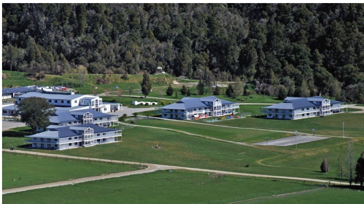
Gloriavale's community area includes the main building, a service shed, and four accommodation blocks.

The Church's founder is honoured as its leader, as he has been called and equipped by God to oversight the Church. He and several other Shepherds are responsible for the main spiritual and material decisions. Other leaders, called Servants,