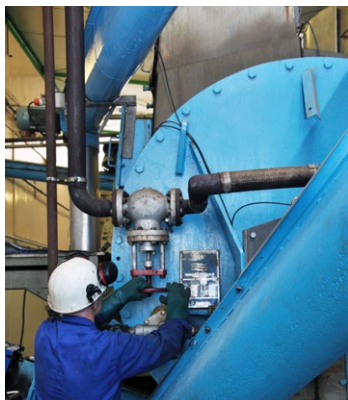
Making meat meal requires huge cookers and machinery.

Our MPI certified rendering plant contributes substantially to our economy, and is an important environmental service to the meat industry, processing offal from three species of livestock - sheep, cattle and deer. About 15,000 tonnes of raw material is processed per year to make about 4000 tonne of meal and 1500 tonne of tallow. We are the largest producer of cervine meal in the world, to the best quality. The tallow is sold world-wide for biodiesel, soap, and for use in pharmaceuticals.