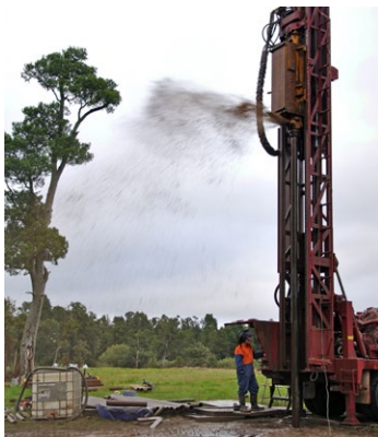
Drilling for coal seam gas near Moana.

For several years we have held an exploration permit on the West Coast for oil and gas. We re-opened an abandoned oil well near Lake Brunner in 2001, and then in 2008 drilled another well to 845 metres, and we are now ready to drill another well with a newly imported rig. Our oil venture has proved to be a challenging investment for our economic base, while providing a cash flow to the local district. We pray that this project will benefit the entire West Coast in future.