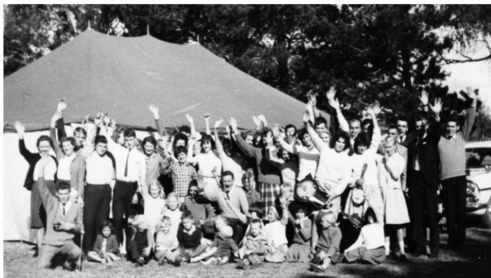
From evangelical tent meetings in Australia to an established Christian way of life in New Zealand...

to start a private Christian School with Biblical values taught by our own teachers. Over time, God showed us the wisdom of all living together on one property. When the Lord provided the means of doing this, we designed and built the buildings that best suited our needs. The Springbank Christian Community grew slowly as God tested our resolve and added to the Church daily such as should be saved. Our foundation principles were established at Springbank through read-