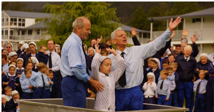
Baptism by immersion is the start of a person's life in Christ.

Forsaking all to follow Jesus means that you should love God "with all thy heart, and with all thy soul, and with all thy mind, and all thy strength, ... and thy neighbour as thyself." There is no room in Community for people who practise their religion only in their heads. Pure religion and undefiled before God and the Father is this, To visit the fatherless and widows in their affliction, and to keep himself unspotted from the world. (James 1:27)