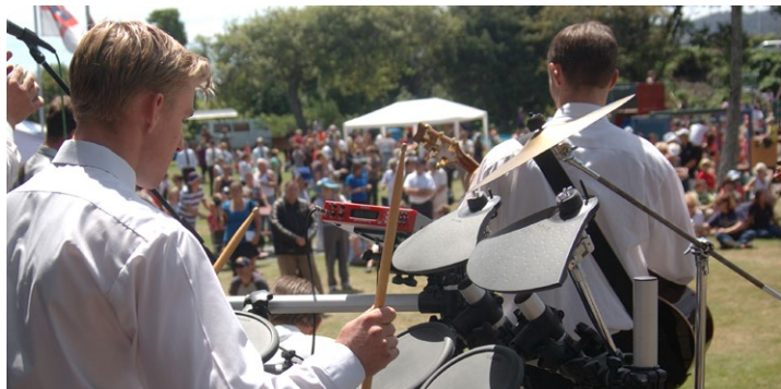
Our musicians regularly play for events in the wider community, such as the Waitangi Day Picnic in Greymouth..