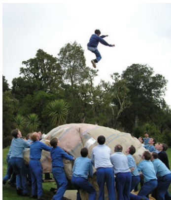
A community version of blanket toss entertains our young people.

do something, then so can everybody else”. Families look forward to several days of vacation each year, and evenings when they invite other families out for tea or supper. Sometimes the entire Community will take a day off to celebrate a particular event, or just to have a break after a busy work period. Our heated indoor swimming pool is used regularly for recreation and exercise. The area surrounding the farm encourages camping, fishing, boating, eeling and tramping.