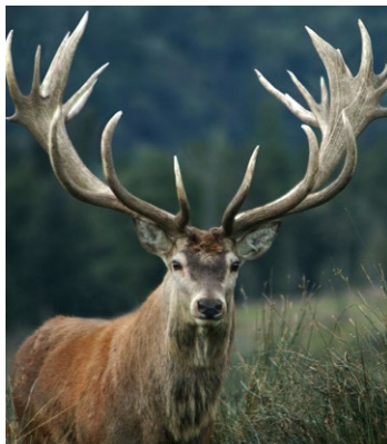
Another splendid Gloriavale sire stag.

Our deer farm has grown from a few animals at Springbank to a fine stud herd of nearly 3000 head. Stags are raised for velvet, venison and trophy heads. Our herd is regularly improved with the best available stag semen for quality, and by using embryo transfer techniques to maximise quantity. Some of our trophy stags are now of world class standard. We also market our own 'Pure Vitality' deer velvet extract as a health supplement for arthritis and a range of other conditions.