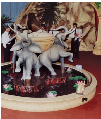
The young people made this fountain for a Married Couples' Tea