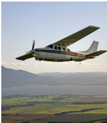
Our pressurised Cessna 210 over Lake Brunner.

Air West Coast is a small but highly visible company, servicing the West Coast with maintenance of light aircraft and helicopters. We also fly charters anywhere in New Zealand, and make scenic flights throughout the South Island. Our experienced engineers and pilots have undertaken several challenging projects over the years, including refurbishing large helicopters, a twin engine turbo prop aeroplane, and flying ferry flights from Europe to New Zealand, and from New Zealand to the Caribbean.