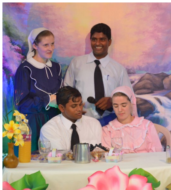
Couples celebrate a recent wedding at our Indian community.

Thousands of visitors have heard the gospel and seen it carried out at Springbank and Gloriavale. The practical Christian life shows people how Jesus expects them to live, and it provides the means of doing that. This powerful living witness greatly supports the preaching of God's Word. A Community life instantly provides new converts with an example of how to live for Christ. Many people can also give help and guidance based on their own experience of the practical sharing Christian life.