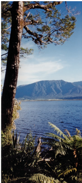
Gloriavale Christian Community is found beside Lake Haupiri, at the foothills of the Southern Alps.

At Gloriavale, we live, work and socialise together within the bounds of our faith, creating a society in which our children can grow to maturity and pass the faith to succeeding generations. Here, the aim is to make a place where it is hard to live a selfish worldly life, but easy to find God's will and live in daily service to the Lord Jesus.