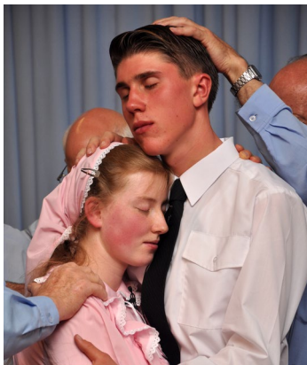
Elders pray for a couple after they have made their vows.

Marriage is a symbol of the bond between Jesus and his Church, and we look forward to the Marriage Supper of the lamb, which we will celebrate when Christ returns shortly to take the Church out of this wicked world, and to himself.