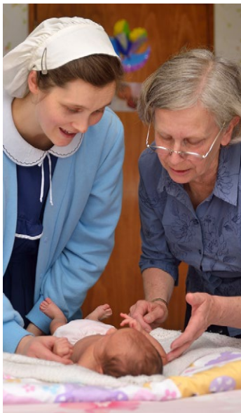
A visiting midwife checks baby's health on one of her regular visits.

Home births are important events, with at least 30 babies born each year at Gloriavale. This is a direct result of the modern home birth movement, which began in Australia. The community's founder and his wife began to have their babies