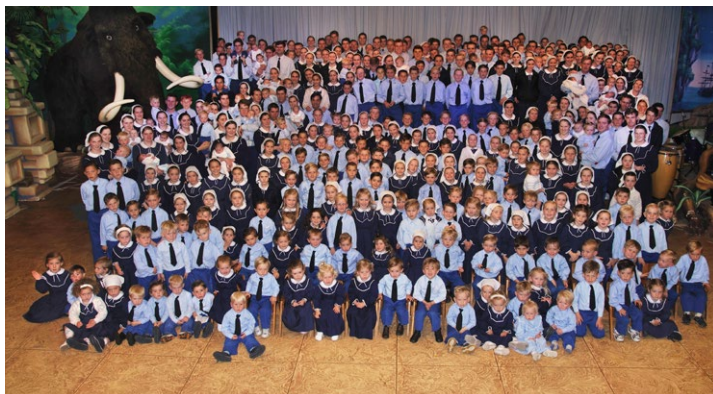
If we practised birth control, these people would have been flushed down the toilet, aborted, or never even had parents to give them life.