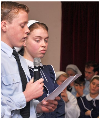
A young man reads his commitment to the Church before signing it before witnesses.

Baptism is essential to salvation from sin, and one of the first works of faith, enabling a believer to have a true victory over the evil of this world. The outward act of baptism is immersion in water, but the spiritual side is an act of God, where a believer's Adam nature is buried, and a new creature is raised with the same power that Christ has over sin. While baptism into Christ requires a commitment from the believer, we also commit ourselves to sharing everything together as adults. Committed members of the Community expect themselves and each other to keep the principles of ' What We Believe ', so that we may all live and work together in peace and unity. The commitment for older people can be made when anybody feels they understand the depth of duty we have to Christ, and the promises help to provide a firm foundation for our life together. Committed members of the Church know what to expect from each other.