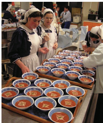
The sisters produce three meals a day for more than 500 people.

produce for future use. Our kitchen is equipped with efficient commercial grade machinery, and designed to handle a large amount of work. A team will also manufacture dresses, trousers, shirts, overalls, underwear, jackets, concert costumes, or soft furnishings. Other sisters work as early childhood and school teachers, in the office, or as telemarketers for our moss company. The sisters' contribution to Community life is essential, and well appreciated by all.