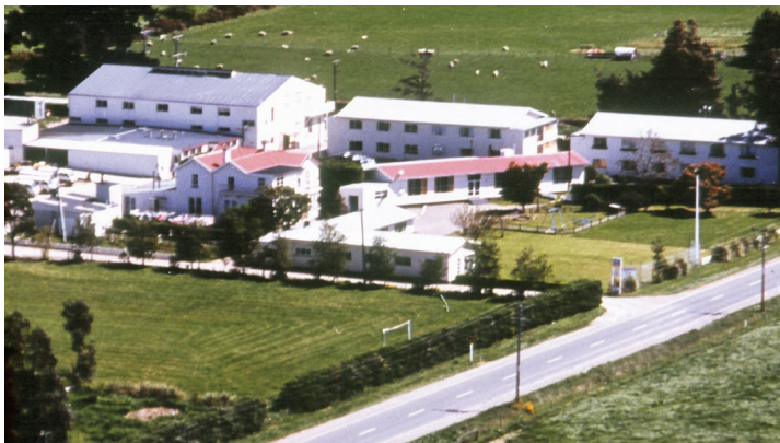
By 1990, the Springbank Christian Community was home to about 200 people, and growing rapidly.

One of the landmarks of the Springbank Community was a biogas digester which provided our vehicles with compressed natural gas (CNG). Our engineers were the first in the world to run diesel tractors on methane. By 1988 we had outgrown Springbank, and bought another farm nearby, ready to expand. But the Lord had prepared a better place for us on the West Coast. In 1991 we began to shift.