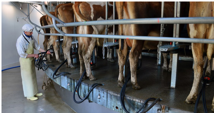
A farmer checks cows milking in the new 54 bail rotary dairy. We are currently milking about 1000 cows at Gloriavale, and 1200 at our other two farms.

We have recently set land aside for a school dairy so our High School boys can have practical experience with their own herd of about 50 cows. They provide the community's milk and handle all aspects of herd and pasture management, milk quality, calf rearing and animal health.